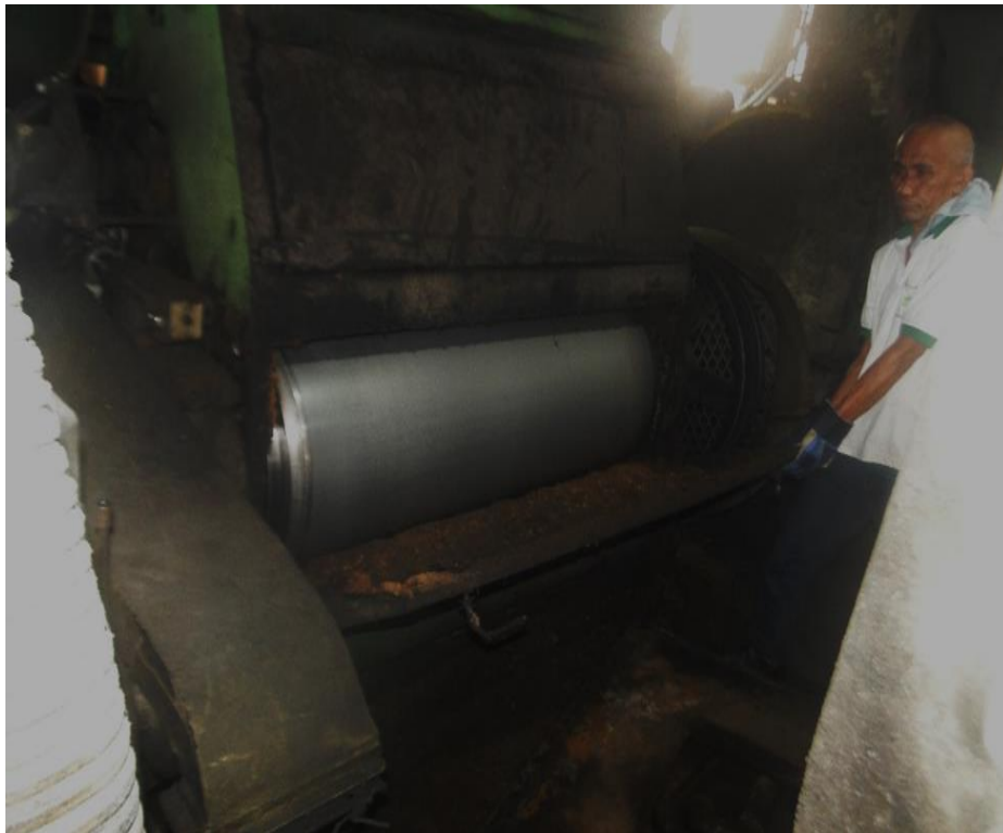
DOQA Roller 600mm dia. X 1250 mm length