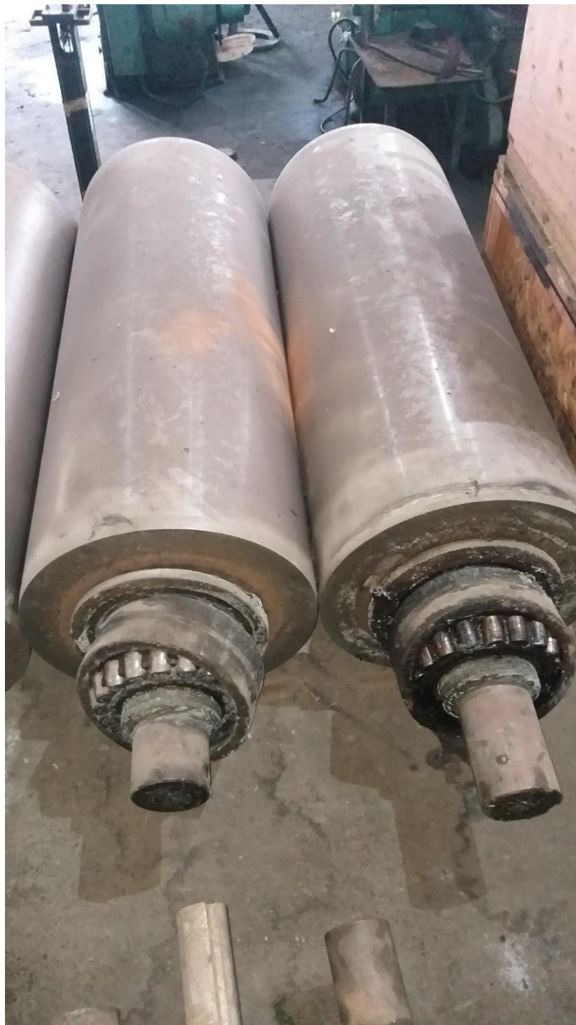
Flaker Roller, DOZC 800mm x 2000mm, 540-580 BHN, Model 7485