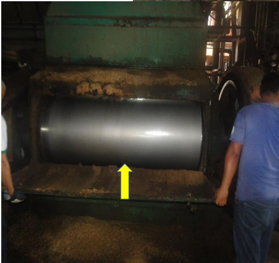
DOZC Roller 800mm x 2000 mm length