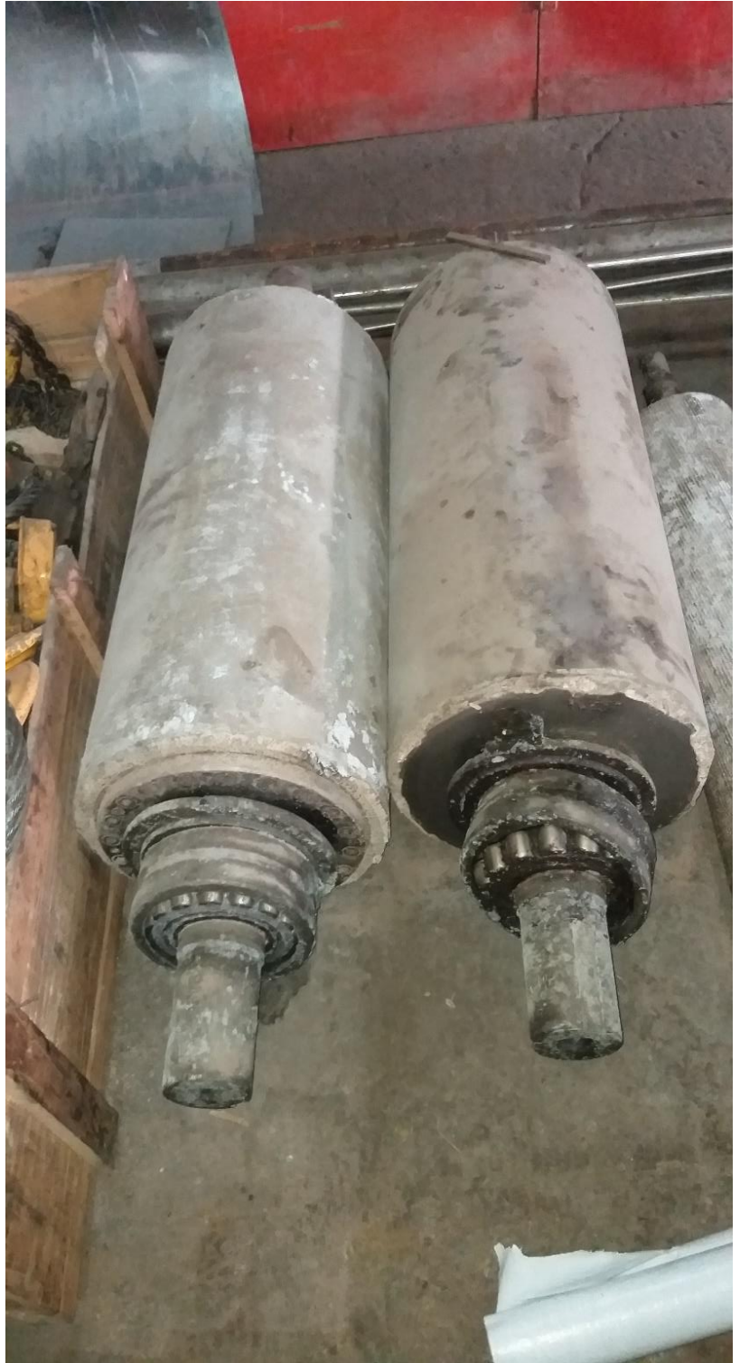
Flaker Roller, DOQA 600mm x 1250mm , 540-580 HB, Model 7479